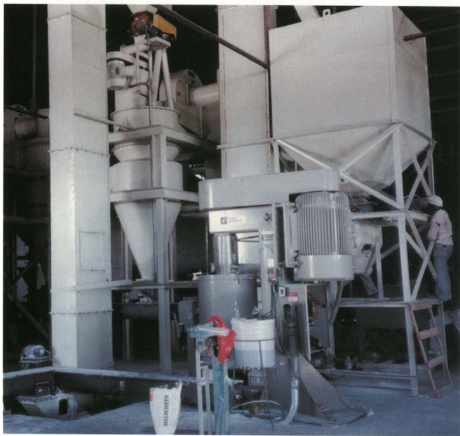
Using an air classifier (left) more than doubles the high-speed ball mill's grinding rate.

The mill is generally used in a continuous mode, which means the material en-